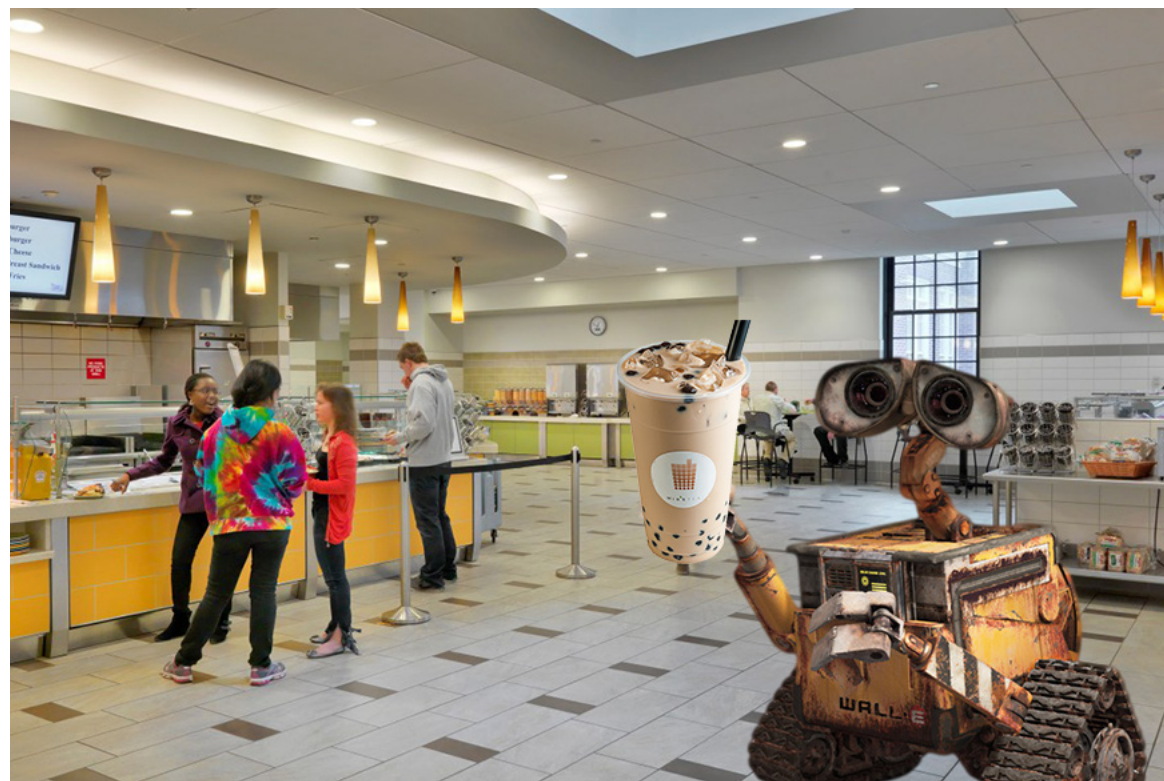
A graphic from DDS promo campaign depicts students in line for drinkable meals.

While some students are resistant to these new changes, citing that they “miss chewing” and that they “don’t understand why