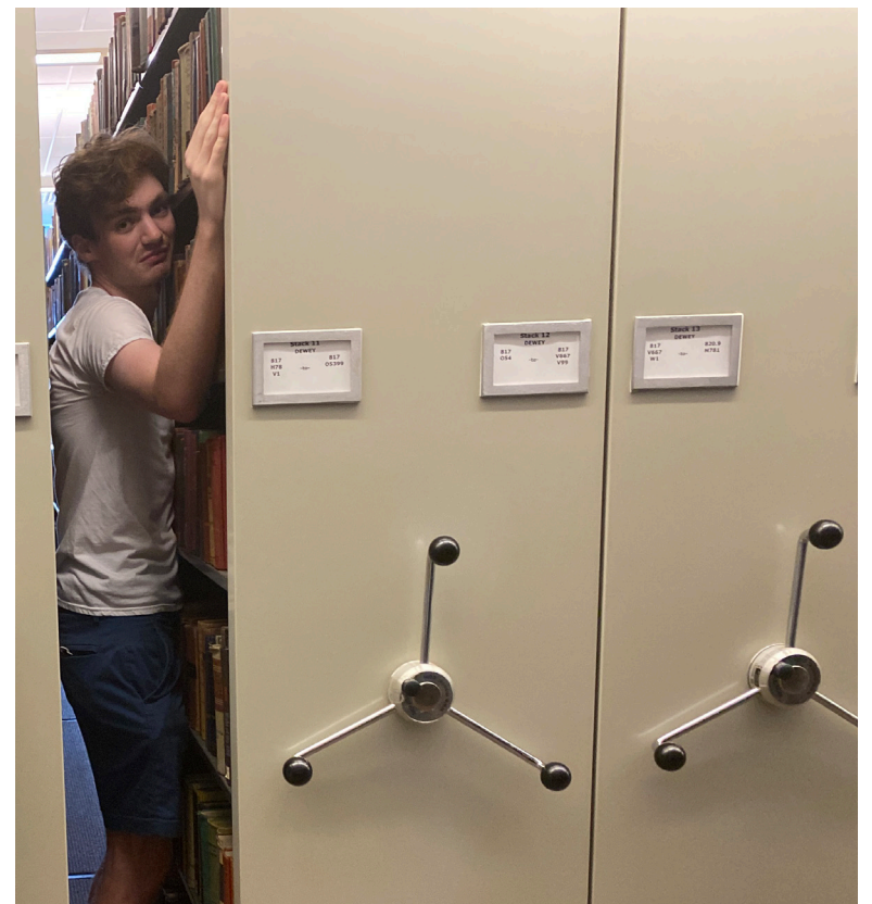
Students reenact glorious crushing.

Experts estimate that the next Baker-Berry crushing will occur from somewhere in the next 100-200 years. But don't worry if you missed this one! Due to the high volume of excitement, there is a 1% chance that Third Floor Berry may experience the same phenomenon, so keep your eyes peeled.