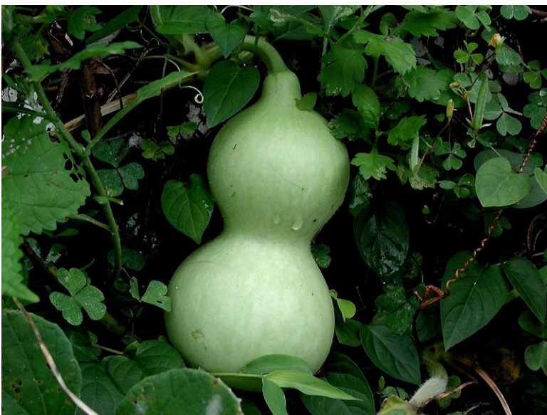
Disgusting, wretched, fucking disgrace of a plant.

At press time, the gourd was decoratively placed on Collis Porch.