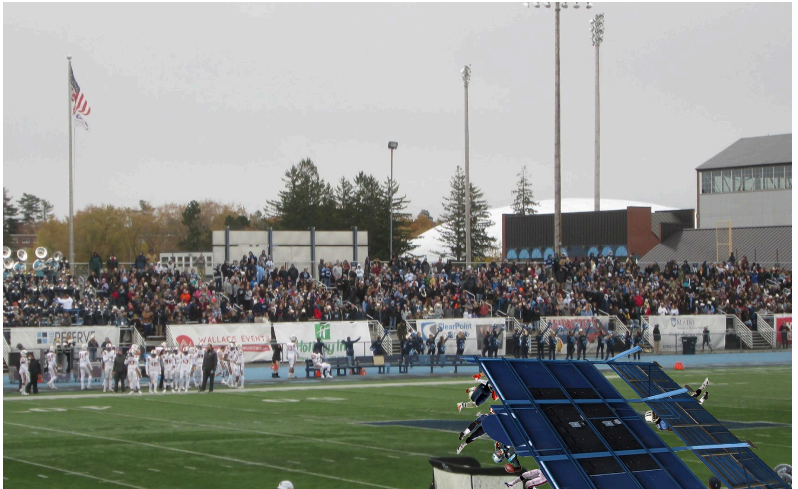
Football team flat