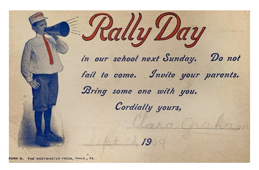
Figure 4. NEXT SUNDAY IS RALLY DAY PLEASE COME. R. D. No 205. G & W Co.,

Figure 3. Rally Day. Form D. The Westminster Press, Phila., PA. Unpostmarked/Undated.