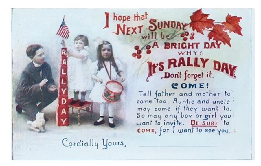
Figure 6. RALLY DAY. R. D. No. 5. Goodenough & Woglom Co., 122 Nassau St., N. Y.

Goodenough & Woglom Co., 122 Nassau St., N. Y. (n.d.)