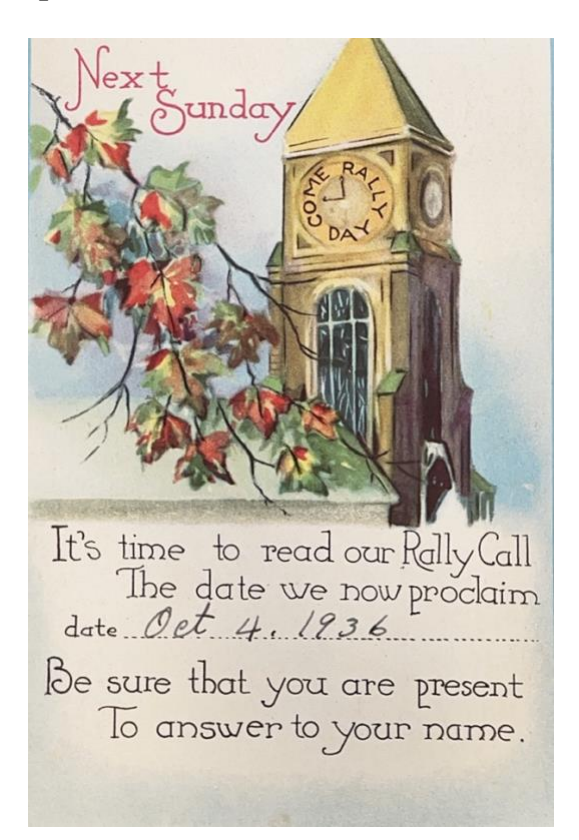
Figure 10. RALLY DAY IN OUR SCHOOL. Form W. The Westminster Press. Phila. PA.