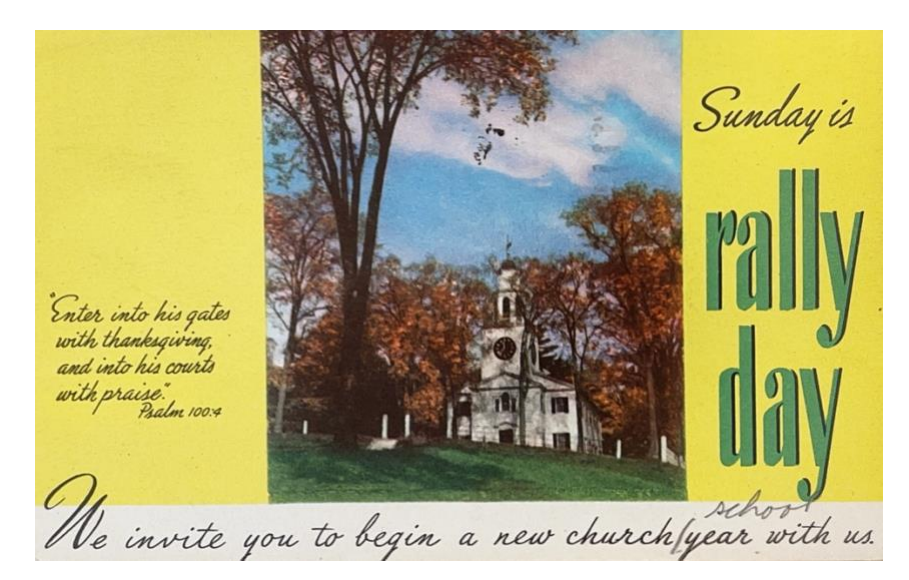
Figure 8. COME UNTO ME... No. 1018. Abingdon. Lito in U.S.A. (n.d.)

Figure 7. SUNDAY IS RALLY DAY. Form 756. S. P. Co. Printed in U.S.A. Kodachrome by Harold M. Lambert. (postmarked 1949).