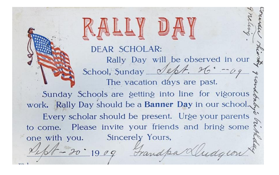
Figure 12. RALLY DAY IS NEXT SUNDAY. No. 710. Abingdon. Lito in U.S.A. (n.d.)