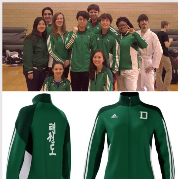
This green Adidas jacket served the club in 2017.