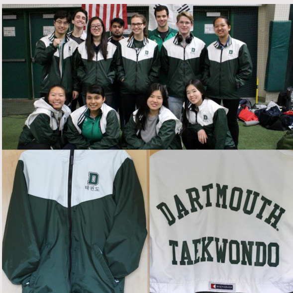
This Boathouse jacket, with the Korean translation of "Taekwondo" under the Dartmouth logo in the front, was created in 2019.