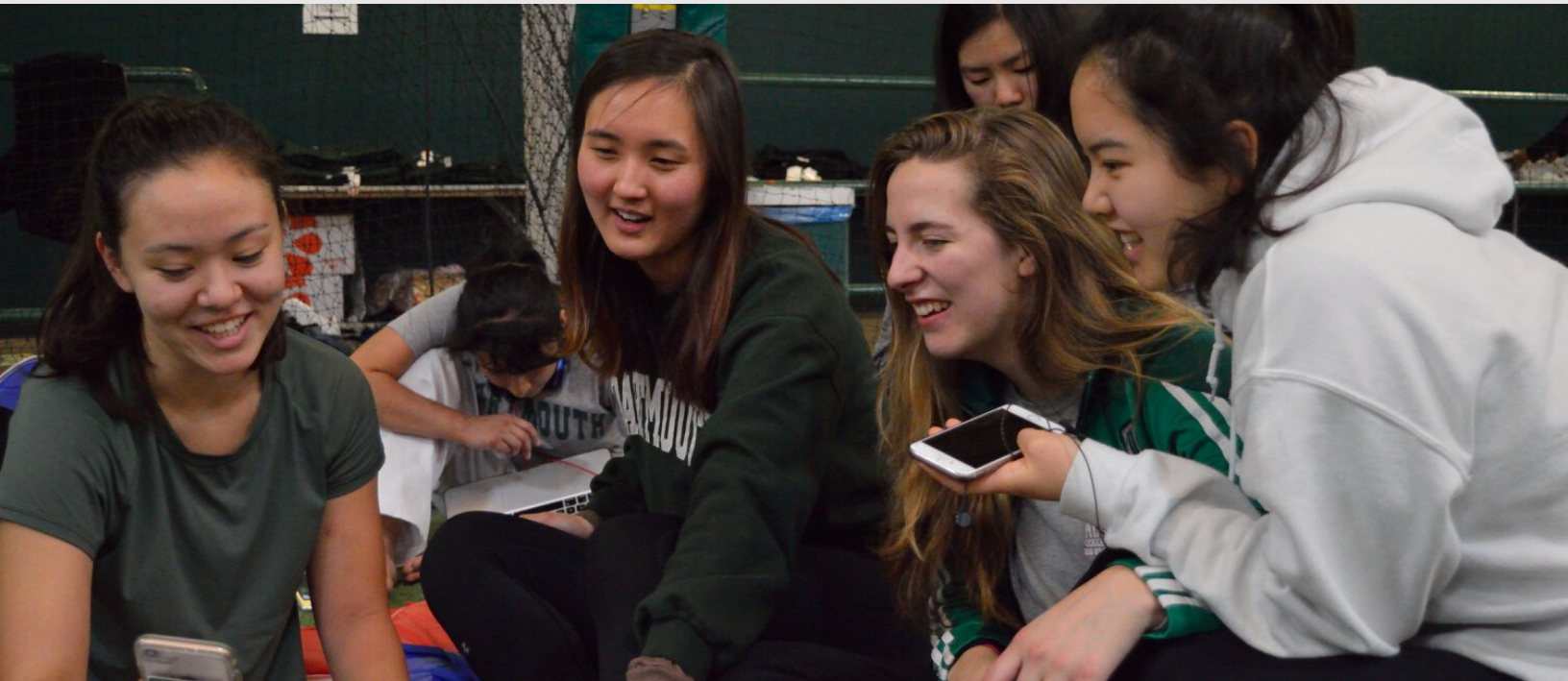
UVM tournament during 18S