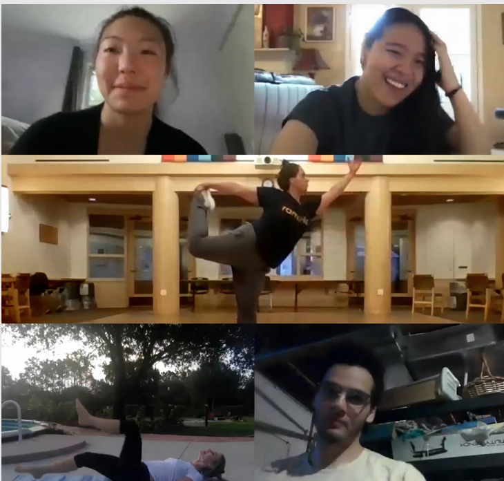
Workout sessions on Zoom

While DTKD was not able to meet during the spring, club members still kept in touch and stayed in shape. Club members joined workout sessions, played online games, and chatted on a weekly basis through Zoom. They also set up an online store for DTKD merchandise during the spring term where members could purchase gear. While COVID-19 has greatly impacted everyone, club members have worked hard to keep the spirit of the Club strong. The Club looks forward to meeting and training together on campus again.