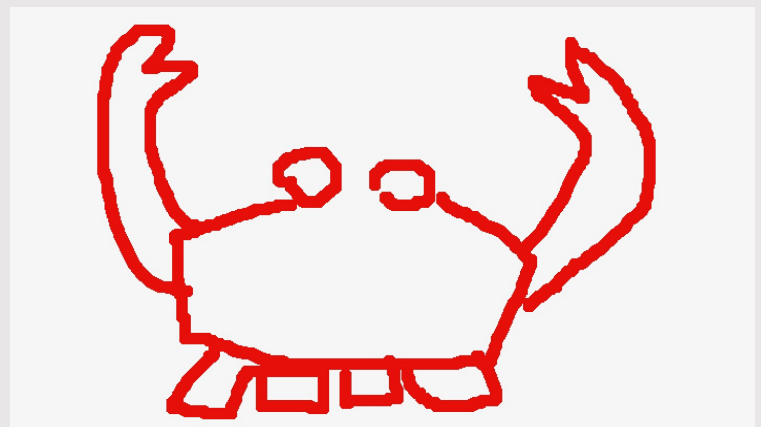
Scribl.io game nights on Zoom