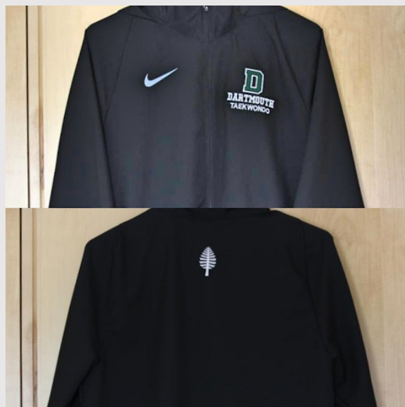
This long-sleeved Nike jacket is the latest product in our series of DTKD apparel. It's light, simple, elegant, and a cool workout outfit to have in a hot summer!