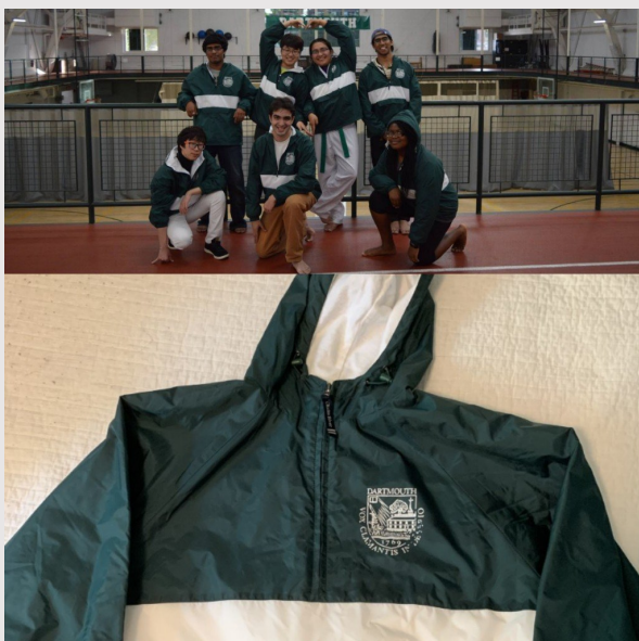
Before 2017, club members wore this Charles River jacket for club practices and competitions.