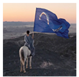
Qyrq Qyz (Forty Girls)

This production investigates Orwell's 20th-century prophecy in the context of 21st-century America, and asks the question, "Are we there yet?"