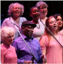
Dartmouth College Gospel Choir

A great Schubert interpreter reveals the unforced lyricism, emotional depth and technical brilliance of three of his piano sonatas.