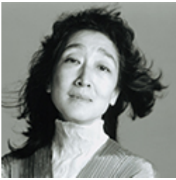
Mitsuko Uchida, piano