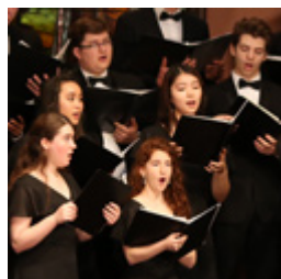
Dartmouth College Glee Club